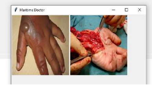
Figure 8. Onboard doctor response.