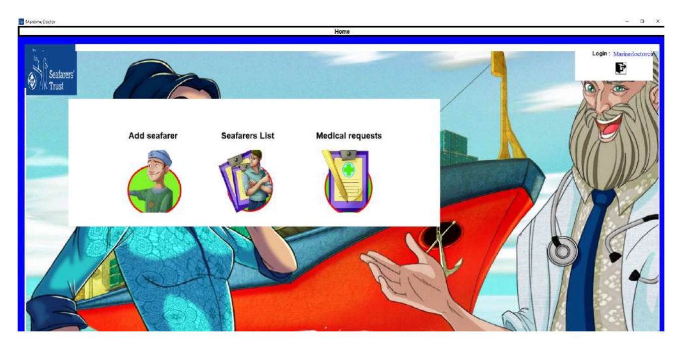
Figure 2. Application home page.